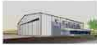
Hope Chapel New Sanctuary and Exp.