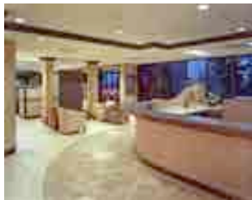
Perry, Johnson, Anderson, Miller & Moskowitz LLP

Accu-Comp Bookkeeping Airport Business Center Corporate Offices Anderson, McDonald, Beldon and Kelly, Attorneys at Law Anray Incorporated Baker -Hughes Bardel Stone & Associates Brelje and Race Engineers Business Journal Century 21 Chicago Title Company Copy Line Ellingson and Jones Insurance Services Empire Communications First America Securities Gallaher Construction Company