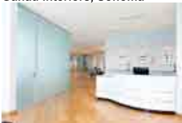
Ganau Interiors, Sonoma