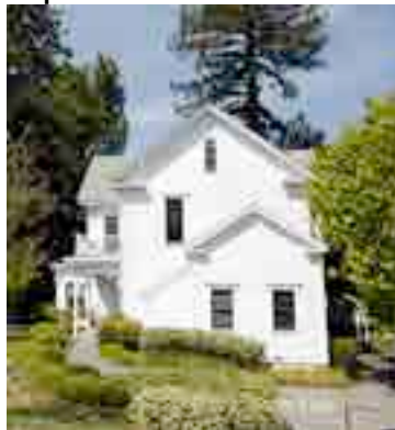
Laughlin House renovation, Airport Business Center