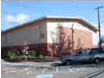
St. John's Church Kitchen